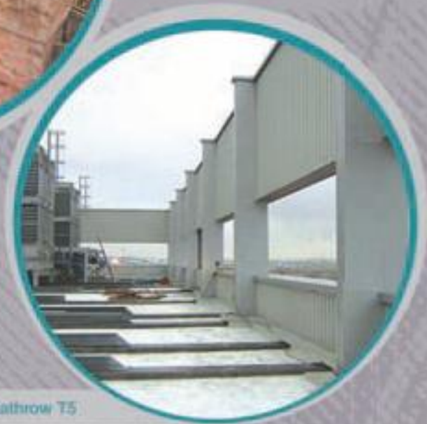
Energy Centre, Heathrow T5