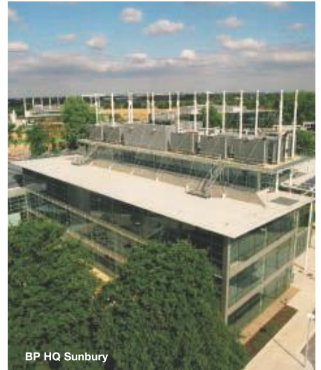
BP HQ Sunbury