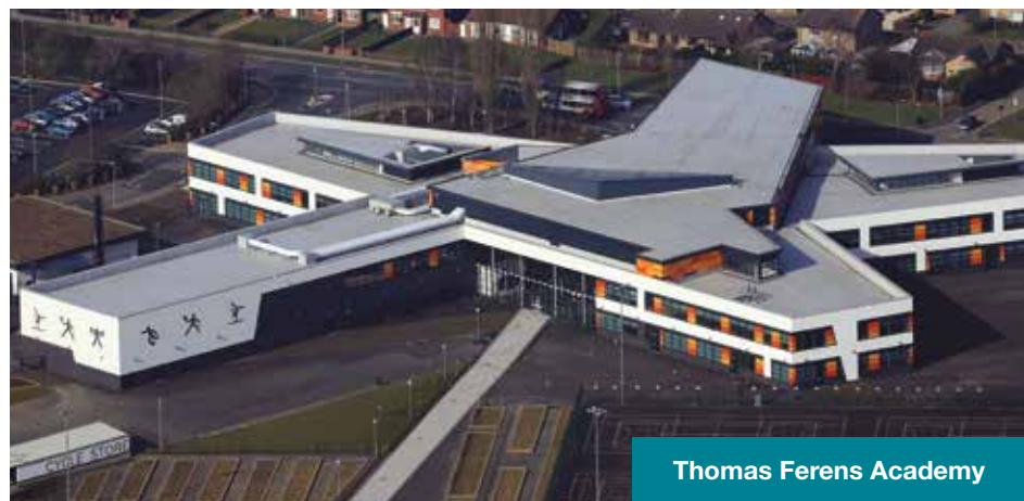
Thomas Ferens Academy