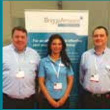
BriggsAmasco Maintenance exhibits at the launch of new RCI show 2014.