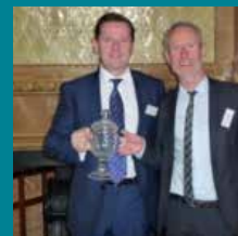
BriggsAmasco lifts Challenge Cup at MAC Awards 2012.