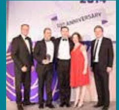
BriggsAmasco wins the Construction News Specialists Awards 2014 in the roofing category.