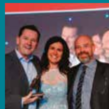
BriggsAmasco scoops NFRC National Award for Reinforced Bituminous Membrane for St Andrews House, Glasgow