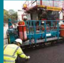
The ground-breaking new Flexiphalte Finisher launches in 2014

A name synonymous with quality throughout the roofing industry, BriggsAmasco is committed to improvement, innovation and adding value at every opportunity. This dedication to consistent quality has seen BriggsAmasco and its projects win numerous industry awards over the years, including Roofing Specialist of the Year at the 2015 Construction News Specialists Awards in the company's 150th anniversary year.