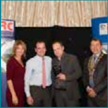
The Kittybrewster project wins Scottish NRFC award in 2014