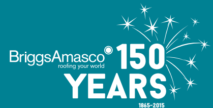
BriggsAmasco celebrates 150 years in 2015 and here's to another 150!