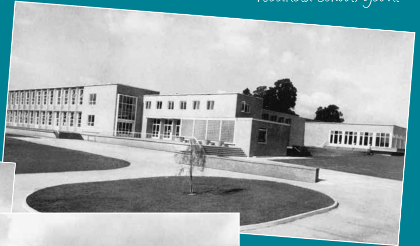
Westfield School, Yeovil