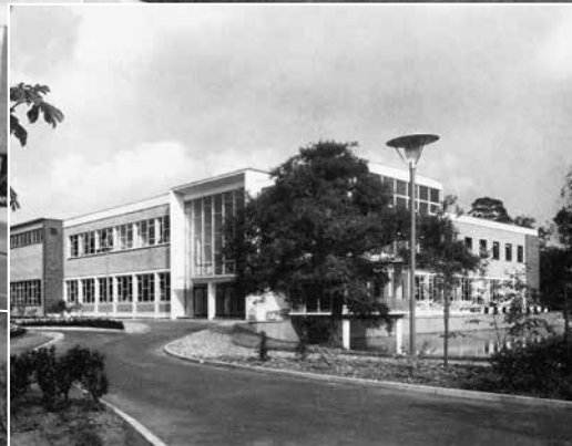
Laboratories, Egham, Surrey for Shell Co. Ltd, 1970's