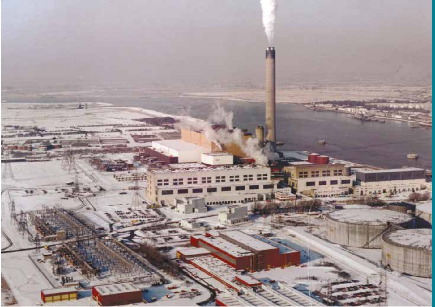
Littlebrook Power Station, 1970