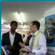
BriggsAmasco looks to the future at MidKent College Open Day.