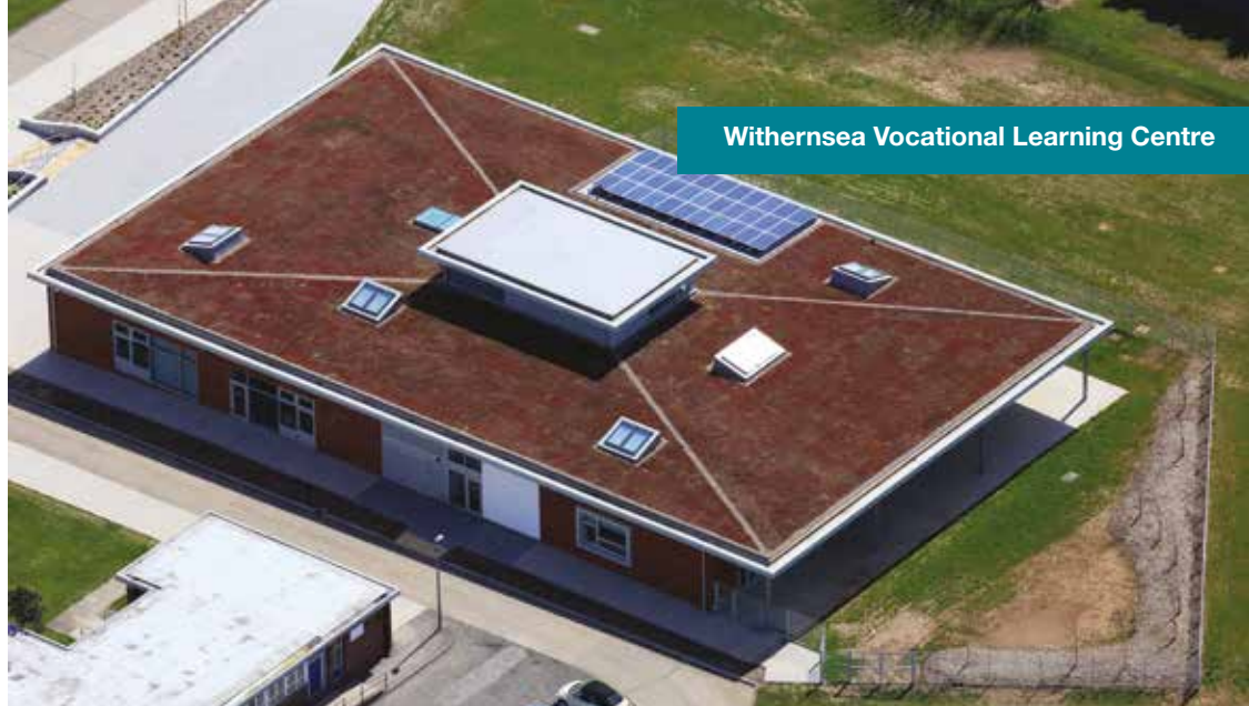
Withernsea Vocational Learning Centre