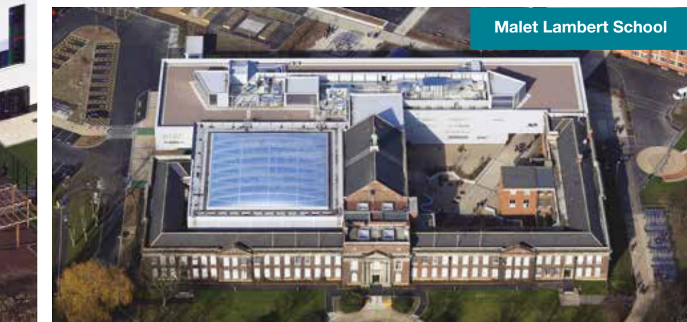
Malet Lambert School