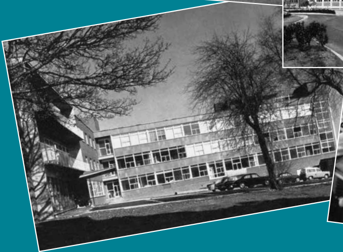
Western General Hospital, Edinburgh, 1960's