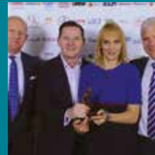
BriggsAmasco wins Single Ply award for Joseph Black Building, Edinburgh at NRFC Roofing Awards 2015.