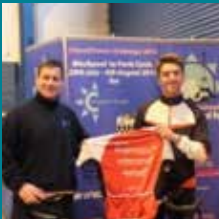
BriggsAmasco raises £20K for the Tower2Tower charity.