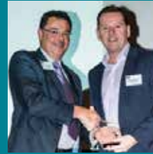
BriggsAmasco attends the Laing O'Rourke Supply Chain Awards.