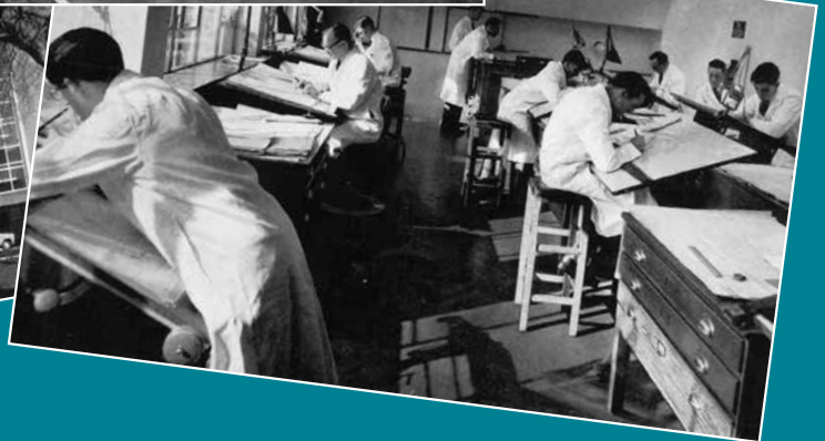
London Office Technical Department 1960's