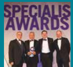
BriggsAmasco wins Roofing category at Specialist Awards 2012.