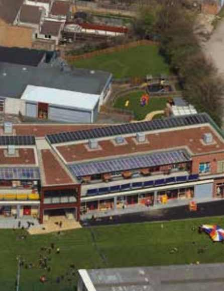
Edward Heneage School